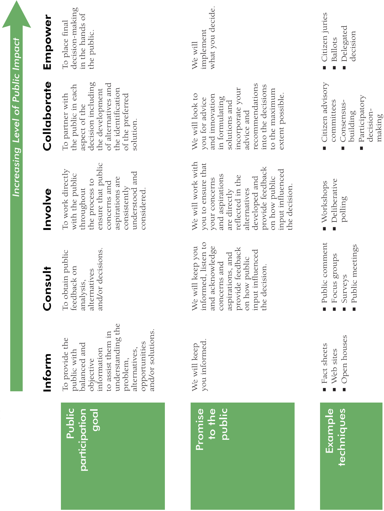
FIGURE 2: The Community Engagement Continuum