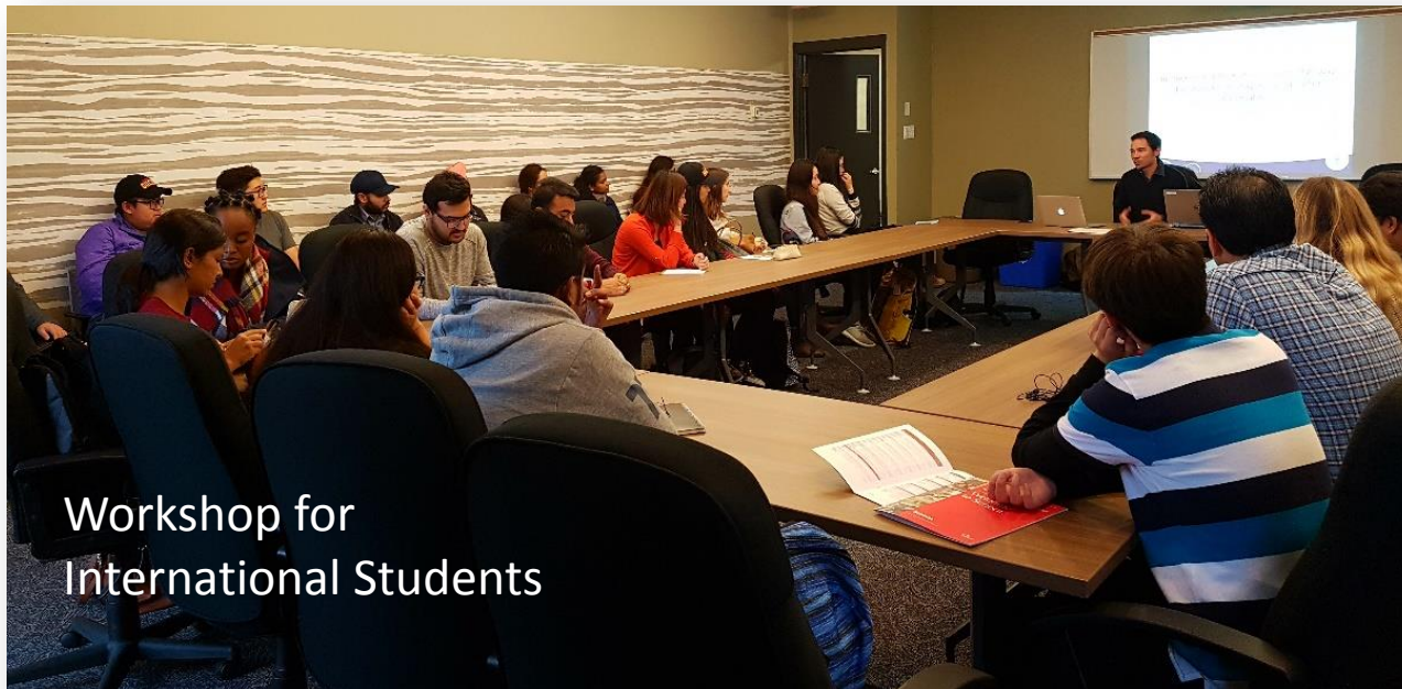
Workshop for International Students